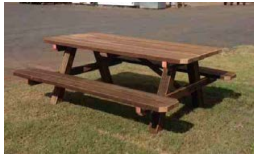
HD006B Blaxland Barbecue Table

The Queensland national parks table is lighter than the NSW version but still is very robust. Infrastrucxion make two robust barbecue tables of its own design and one it manufactures under permission of Guymer Bailey Architects, the HD006B full hardwood table and the Flinders that is on a galvanised steel frame. The similarity between the HD006B model and the national parks table is not coincidental. We redesigned an earlier table with straight legs to incorporate hardware that we use in the parks range.