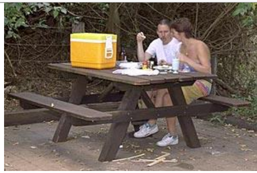
Queensland parks table