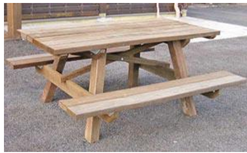
NSW parks table

The Queensland national parks table is lighter than the NSW version but still is very robust. Infrastrucxion make two robust barbecue tables of its own design and one it manufactures under permission of Guymer Bailey Architects, the HD006B full hardwood table and the Flinders that is on a galvanised steel frame. The similarity between the HD006B model and the national parks table is not coincidental. We redesigned an earlier table with straight legs to incorporate hardware that we use in the parks range.