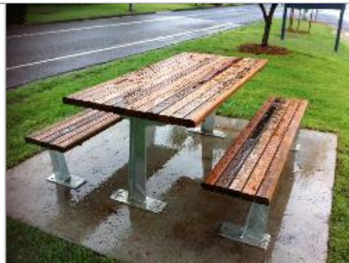
Flinders Barbecue Table