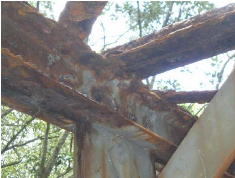
Rusty bridge over a salt water creek

What would you think if, for your next coastal footbridge, your consultant specified black steel, so badly rusted that it only had 30% of its strength left and with no corrosion protection. Well, frankly you would change engineers, its not logical. But this happens all the time with timber and it's just as illogical. It is a credit to timber that it gives any service at all. Spotted Gum F17 unseasoned has only 60% of the strength of that species without any defect and for ironbark it is only 48%. The moment you go to kiln dried the percentages drops to 38% and probably 28% respectively (it is actually so low a grade for ironbark that it is beyond anything conceived as saleable). It is mind boggling to then consider F14. I continually see that specifiers do not differentiate between the strength properties of green off saw and kiln dried. It is critical that you do as you cannot expect anything on site any better than what you have asked for. Of course this is all fairly complicated but Infrastrucxion is here it guide you with appropriate products. Basically, it won't work with steel and it won't work with timber.