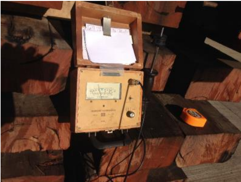
Moisture Metre being used on 300x150 hardwood

On a recent consultancy I checked the moisture content of large hardwood timbers. It was assumed, as you would, that 60 year old timber would be seasoned. I thought not, and when I drove in the prongs, the metre showed a moisture content of 25%. Timber does not start shrinking till it reaches 25% so any timber resawn from this would behave just like green off saw timber. The lesson, do not assume that just because the timber is old that it is dry. Large timber sections do not dry.