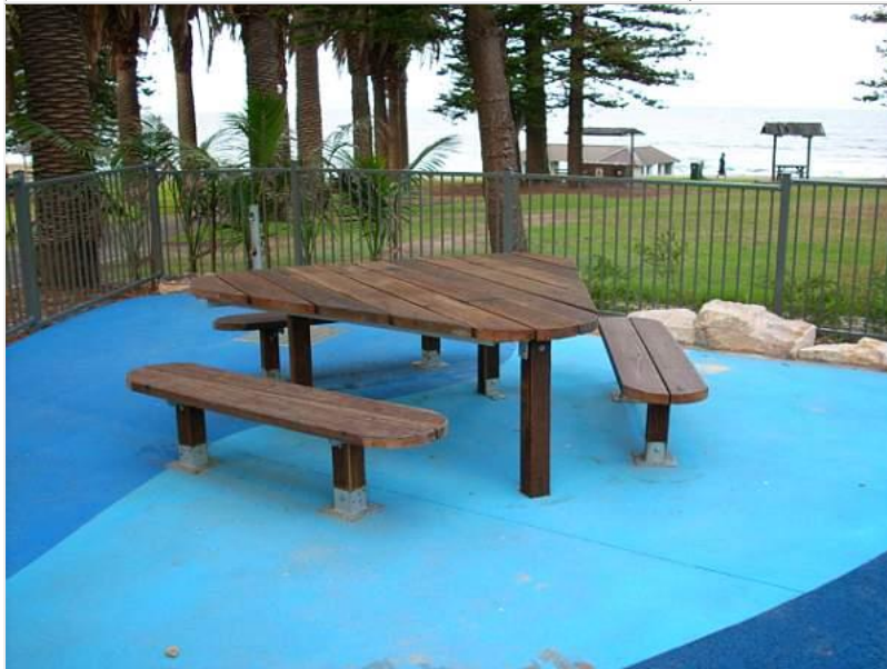
Lawson Barbecue table (Copyright Guymer Bailey Architects)

In the HD006B model the table tops and seats are assembled on stainless angles that simply bolt to the pre-assembled leg and rail units. Sometimes it is more practical to have the tables delivered assembled.