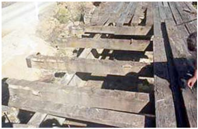
8 year old deck and cross bearers removed due to decay in bearers with Malthoid still showing.