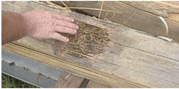
Area around vertical through bolt where Malthoid held water next to the wood bearer causing the cross bearers to decay in 8 years