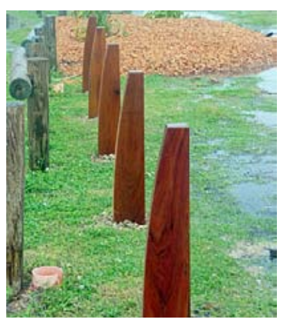
E7 Eclipse bollard newly installed