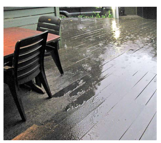
Decking without a gap is a safety hazard

Another issue was because the deck stays wet for a long time, green mould had occurred on the surface and is as slippery as an ice skating ring when wet and very dangerous. I reported this to the property managers because I nearly came a gutsa when getting more firewood to keep warm, even knowing it was slippery.