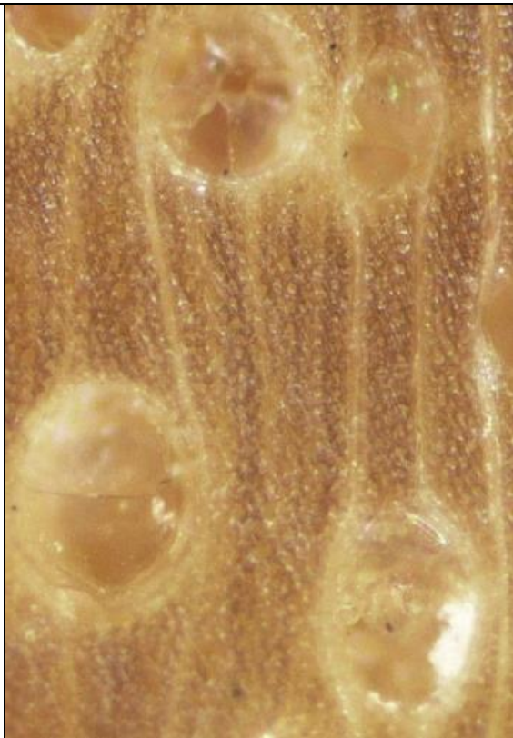
Empty sapwood vessels