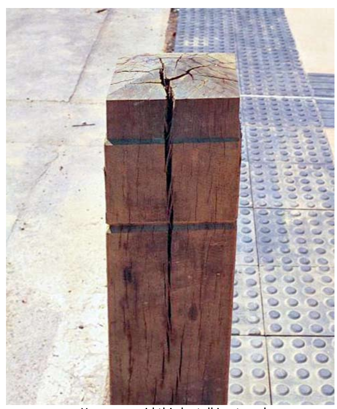
You can avoid this by talking to us!

Australia is blessed to have some of the finest hard-woods available in the world but, we are increasingly finding a deep reluctance to use, them especially in southern states. Sadly, we find the concern perfectly understandable. Let me explain;