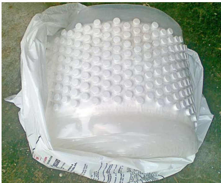
Preschem pole bandage available in 20m rolls