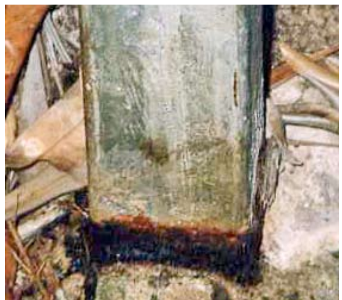
Corrosion at groundline in steel post after 12 years.