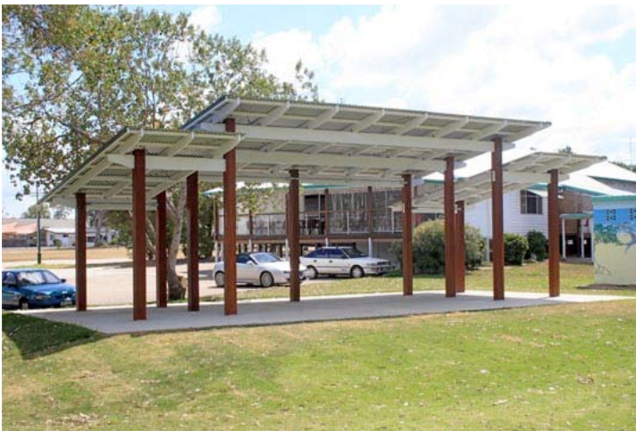
OSA Lindsay triple shelter serving as a performance stage Tin Can Bay with posts directly in ground