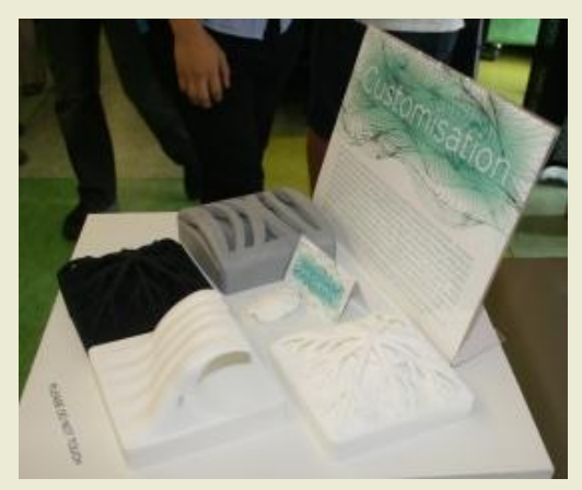
Sample bollard Caps 3D printed

I have heard it said that when Michelangelo carved David someone asked him how he did it. He is supposed to have replied, "Easy, I just chipped away the bits that weren't David". While I am sure it is not true it is a good example of "subtractive manufacturing", the type of manufacturing we are used to with all the restrictive rules of design that allow for the different methods of manufacture that exist. An good example is a titanium bracket in the aero industry which may weigh 1 kg but requires a 10 kg piece to start with. Additive manufacturing builds up an item from nothing (that is why it is called additive). That same titanium bracket may only need 1.3 kg of material if 3D printed.