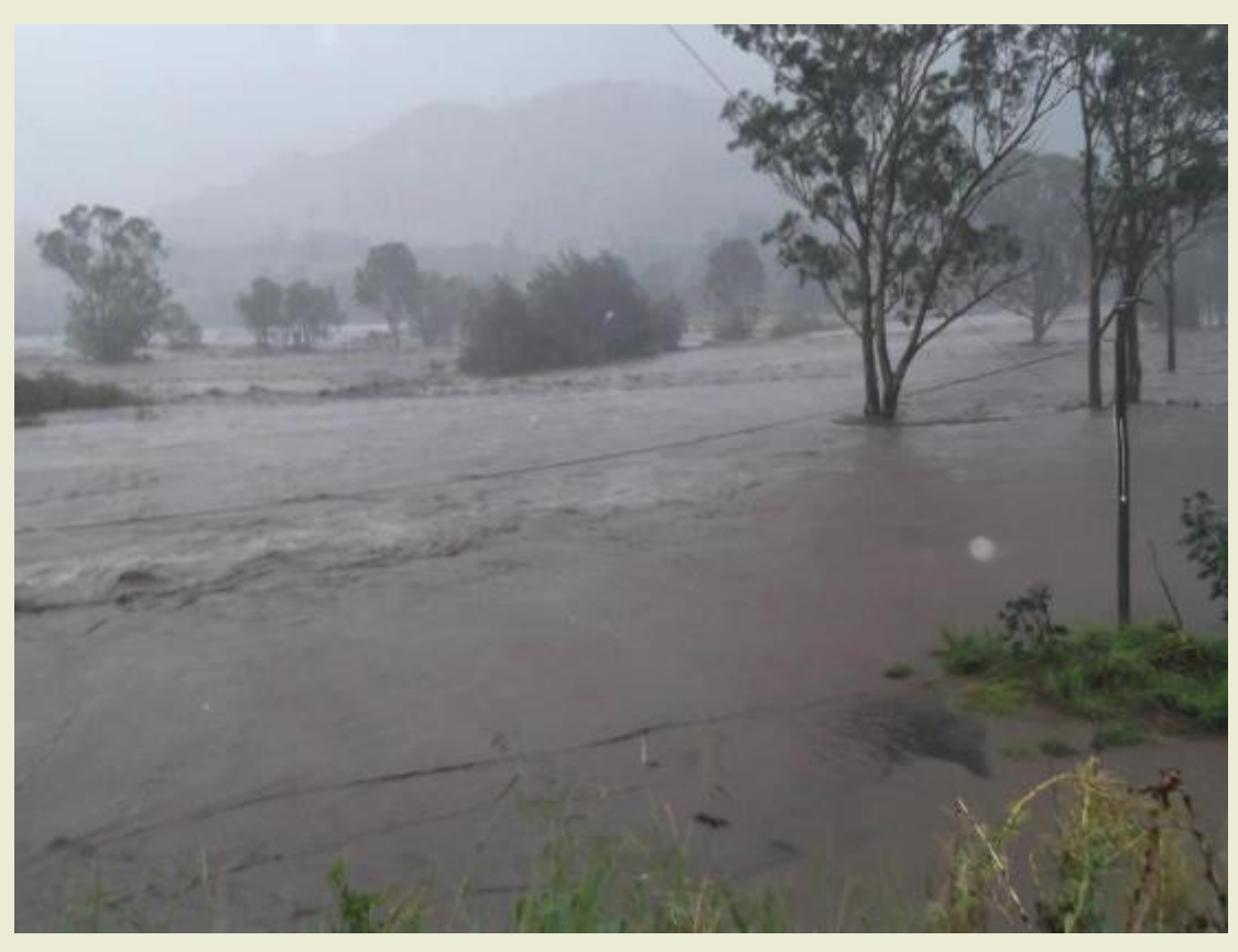
Tent Hill Creek in Flood Jan 2013. This creek flows into the Lockyer Creek and then down to Brisbane River.

Many of my readers will know that the Lockyer Valley, my home region, flooded