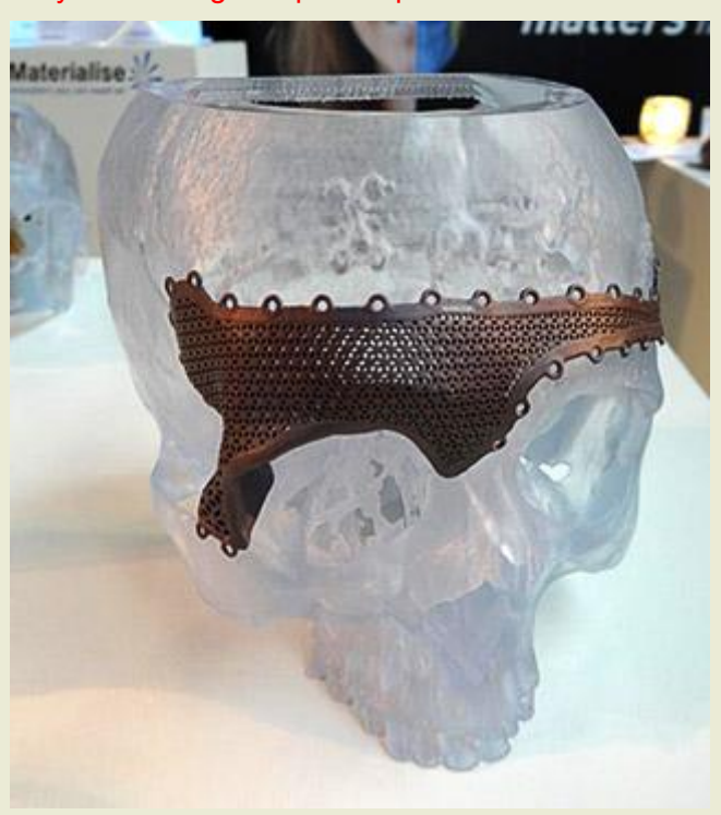
3D printed titanium plates for scanned face of patient with bone cancer