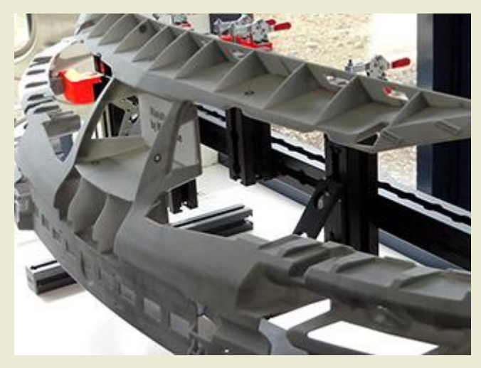
Fully functioning bumper 3D printed