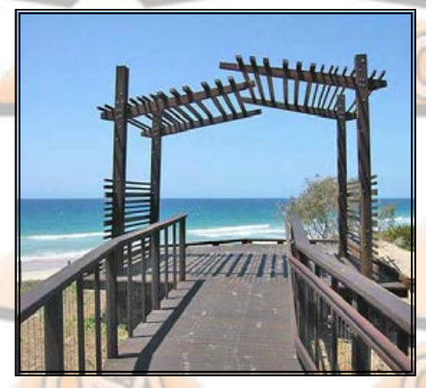
PARK & STREET SETTINGS

With the market for local government moving to steel and aluminum frames (avoiding the cross-bar frequently associated with timber tables) Outdoor Structures Australia presents the simple, yet effective Flinders Table Design providing stylish and economic solution to your construction.