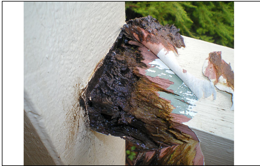
Decay of incorrectly installed LOSP pine handrail

The image above is of an Light Organic Solvent Preservative Treated (LOSP) pine handrail that has failed at a friend's home. He will have to spend $4000 on repairs because, only fifteen years ago, the builder did not spend $10 to seal the cut ends correctly.