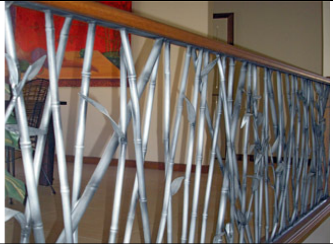
The top two images show rail incorporating our Cruiserline rail