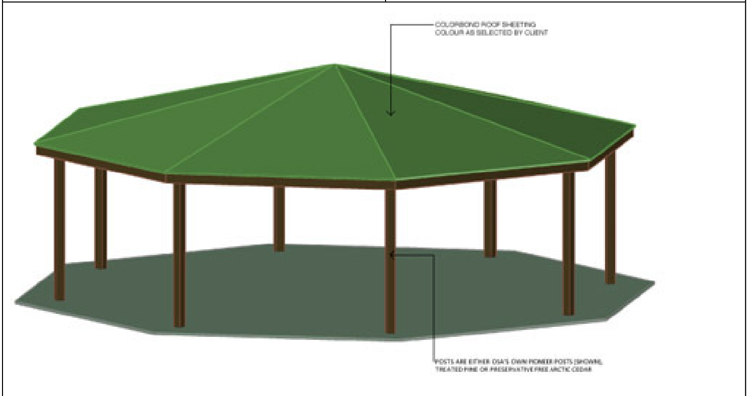
Concept drawings of new 15m octagonal shelter

OSA in conjunction with Wood Research and Development of Corvallis, Oregon, will be bringing a new shelter onto the Australian Market. The shelter is a 14 metre octagon which will be large enough to fit a good sized playground underneath. The philosophy behind this shelter is that the roof has to be high enough for safety under the highest piece of playground equipment. The roof pitch also has to be no more than 2.0 metres high so it can be built on the ground without scaffolding.